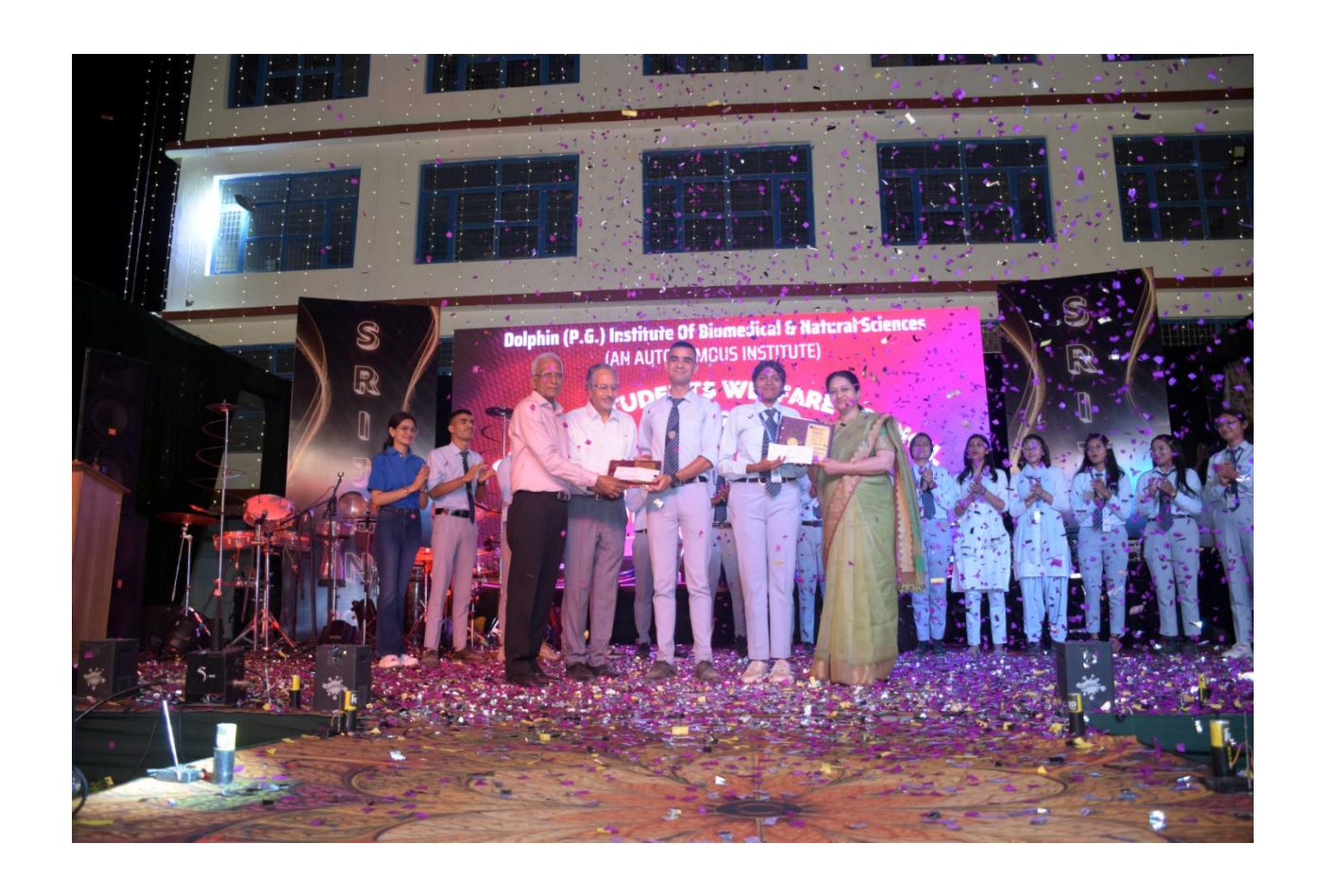
Over All Trophies: Sports Agriculture Department