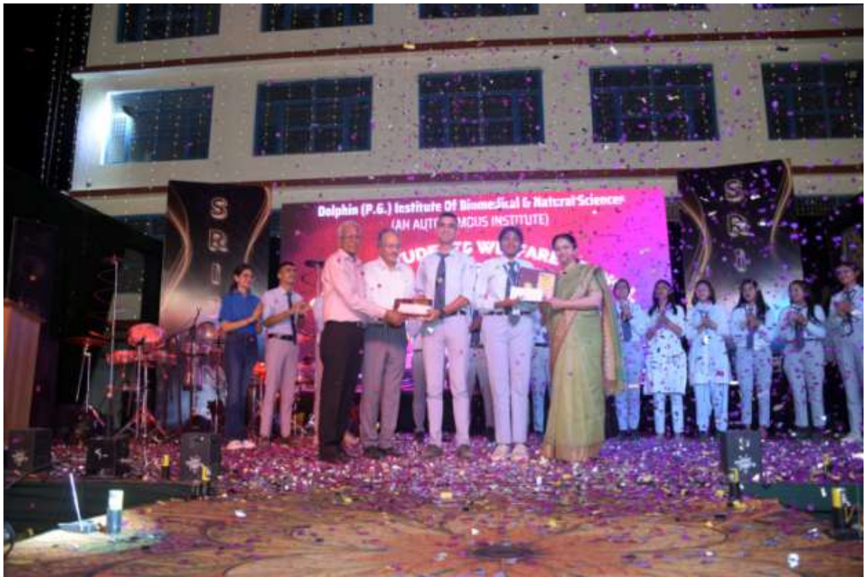
Over All Trophies: Sports Agriculture Department