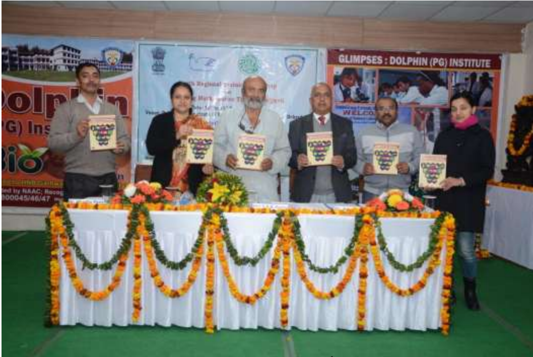
Release of Training manual in the inaugural on 15 th March 2019.