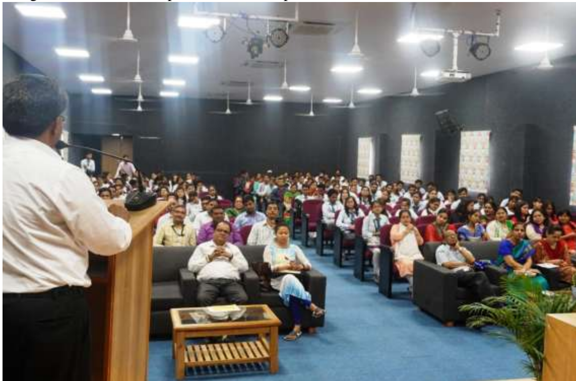
Participants in the Workshop.