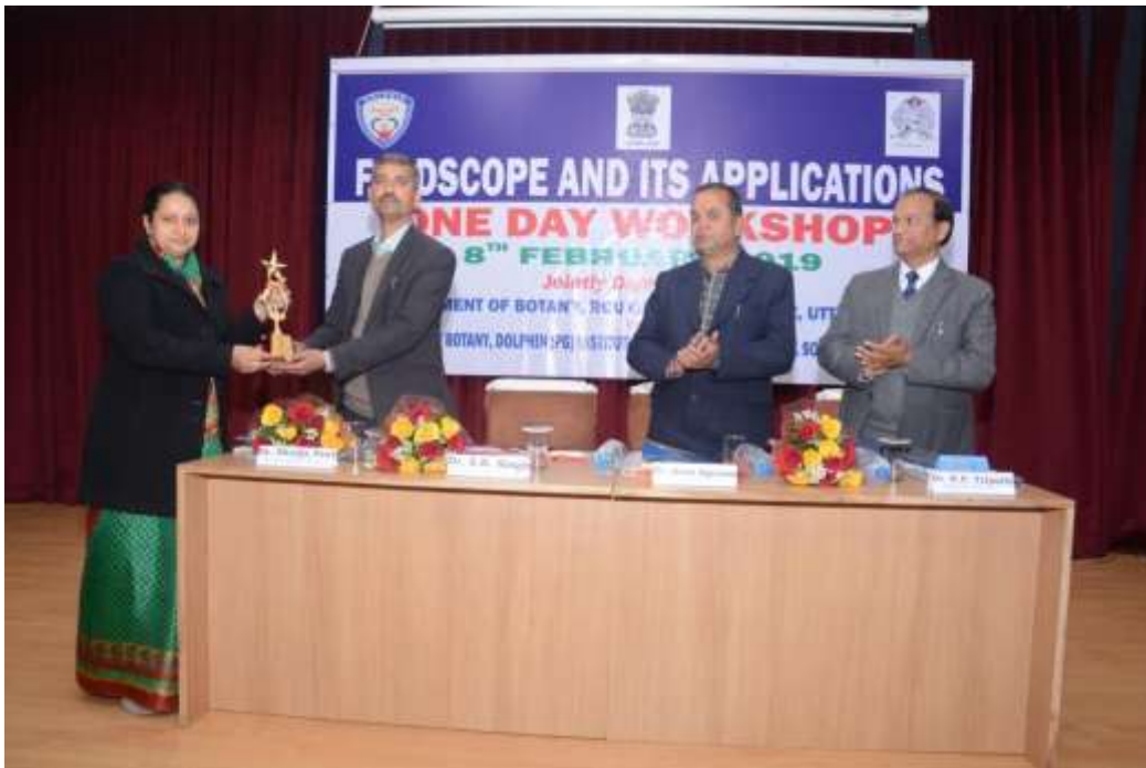
Release of Abstract Book in Workshop on 8 th February 2019.