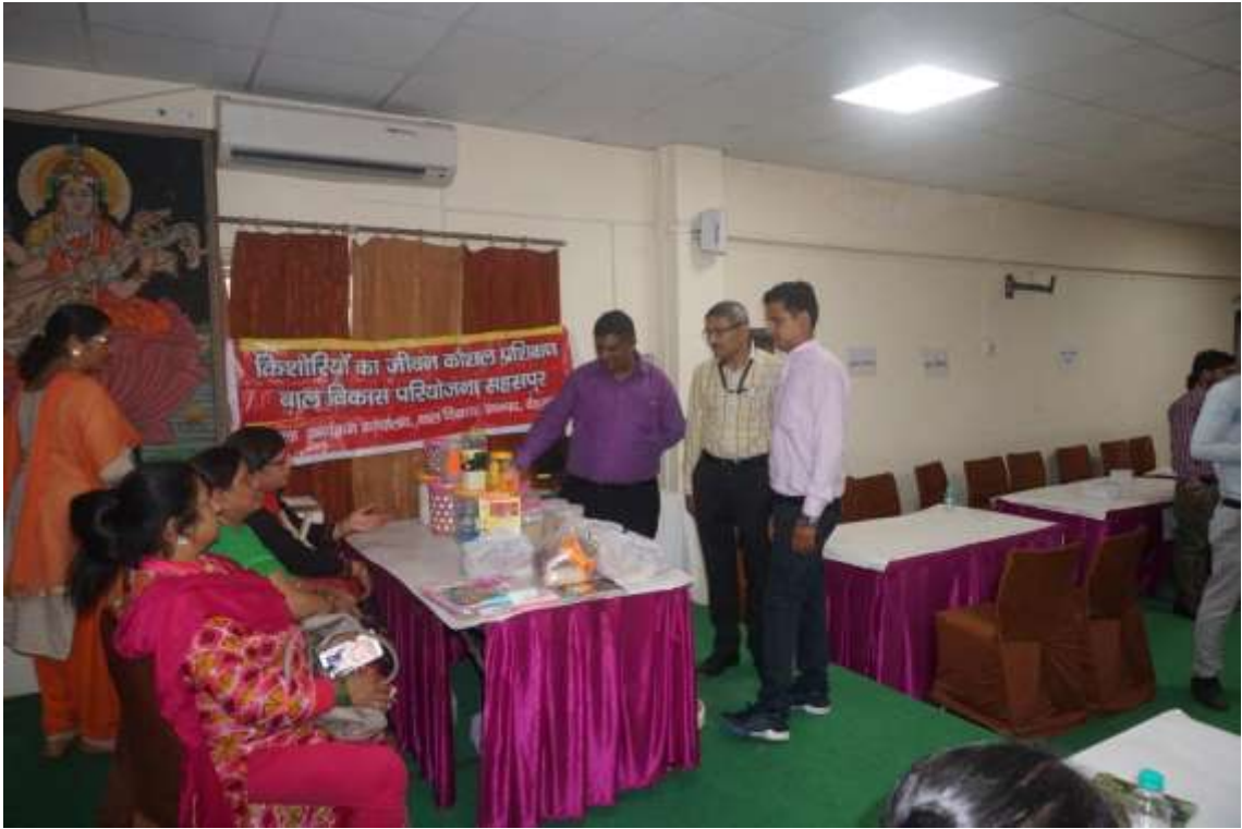
Exhibition of products made by Women Self help groups during the Workshop.