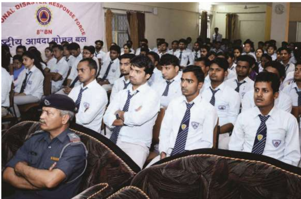
Students participating in NDRF Workshop on Crisis Management.