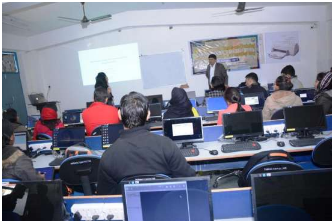
Participants in the Molecular Docking Workshop.