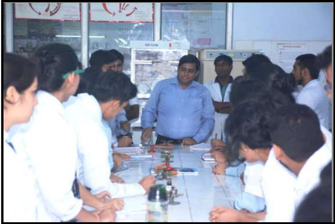
Participants undergoing the hands-on-training during the Workshop.