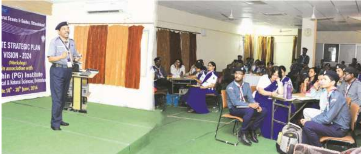
Jt. Director, NHQ, Scouts and Guides addressing the participants of the workshop on 18 th June 2016.