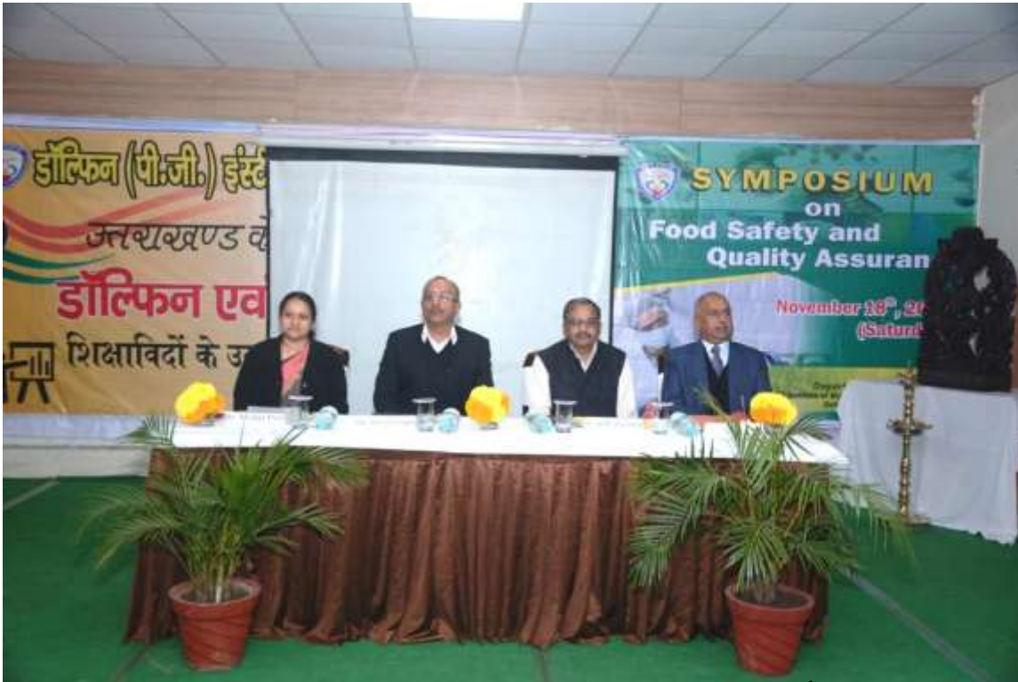
Inaugural of the Symposium on 'Food safety & Quality Assurance' on 18 th November 2017.