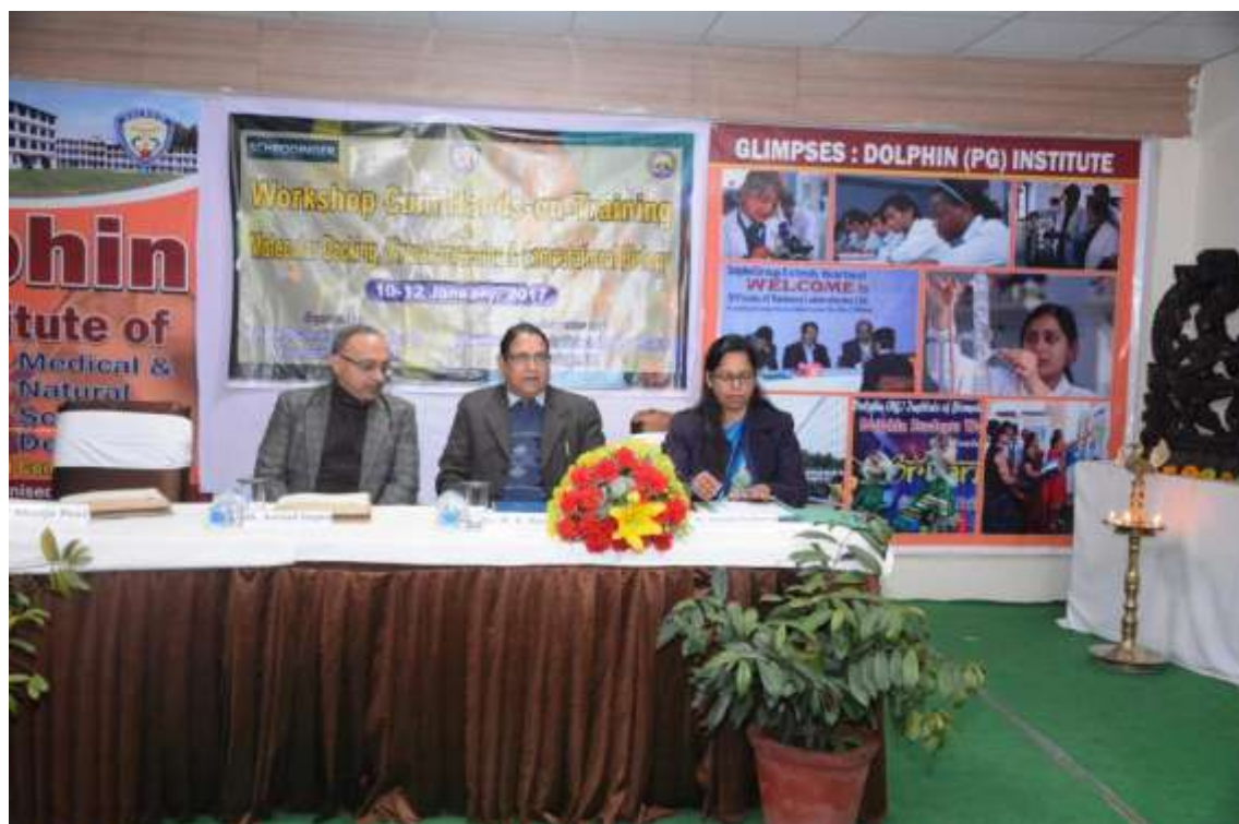
Inaugural of workshop on 'Molecular Docking...' on 10 th January 2017.