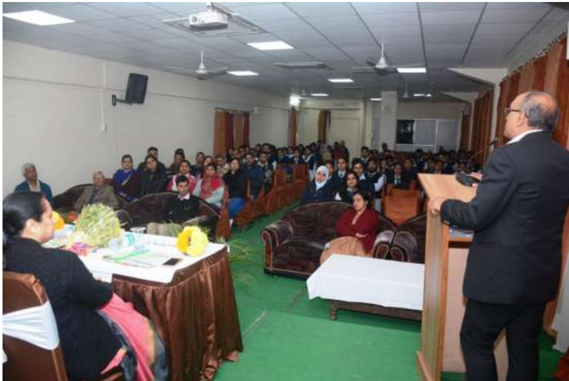
Attentive audience listening to the address by the Chairman, DIBNS.