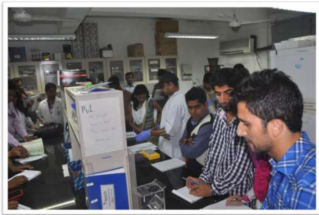
Participants undergoing hands-on-training at DNA Lab of Wildlife Institute of India.