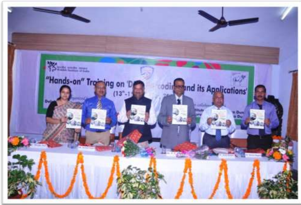
Releasing the training manual for "Hands-on-training on DNA Barcoding on 13 th October 2014.

Some Workshops etc conducted by the College between 2014-15 & 2018-19