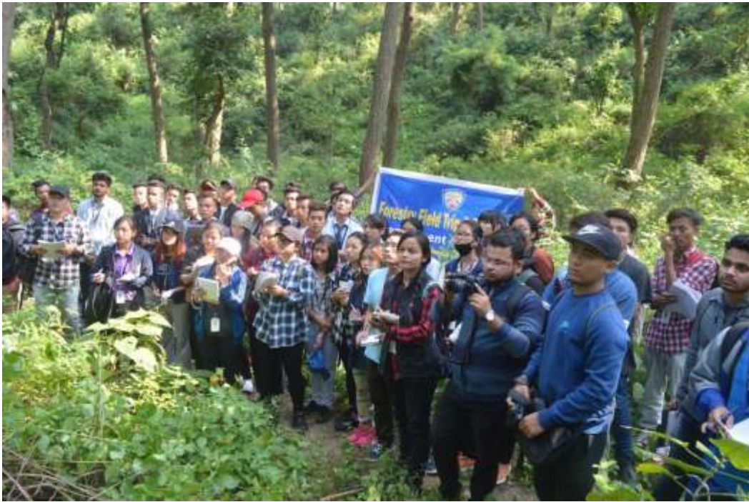
Hands-on-training on 'Forest logging operations' on 28 th October 2017.