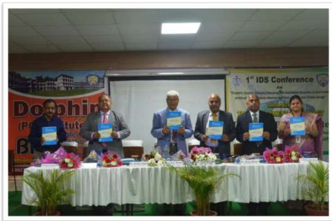
Release of Abstract Book in 1 st IDS Conference on Odonatology on 21 st March 2018.