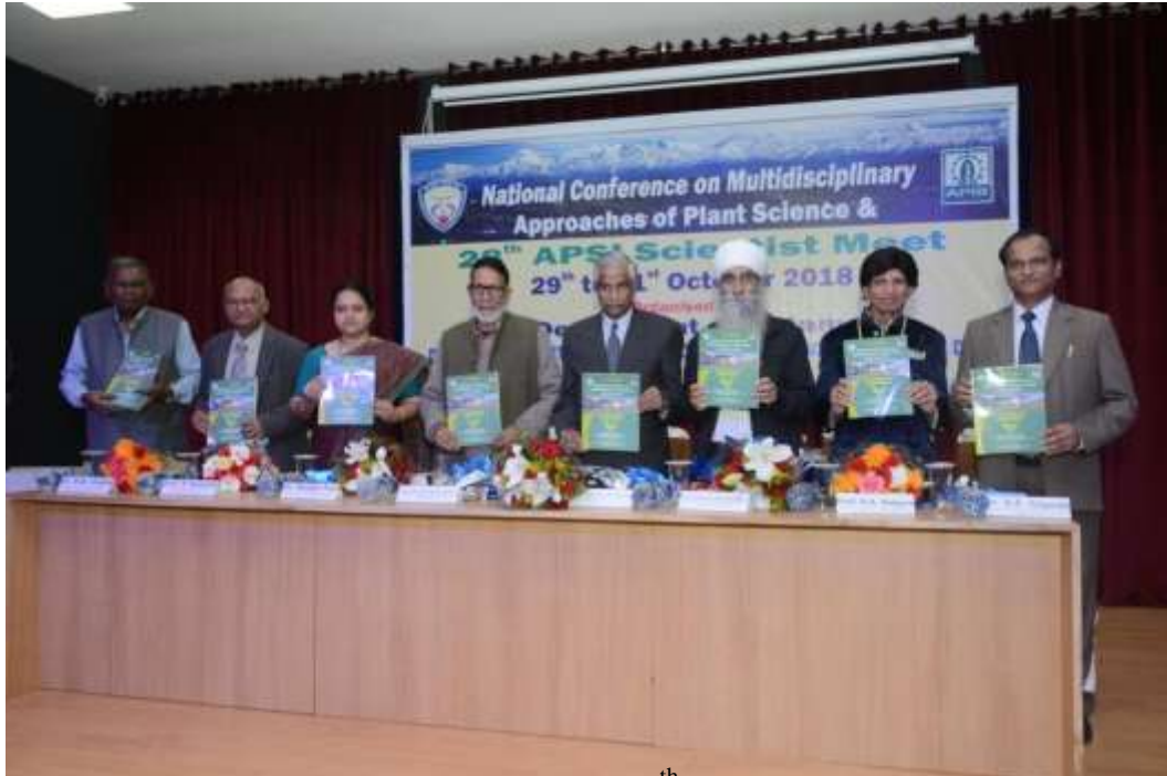
Release of Abstract Book in Conference on 29 th October 2018.