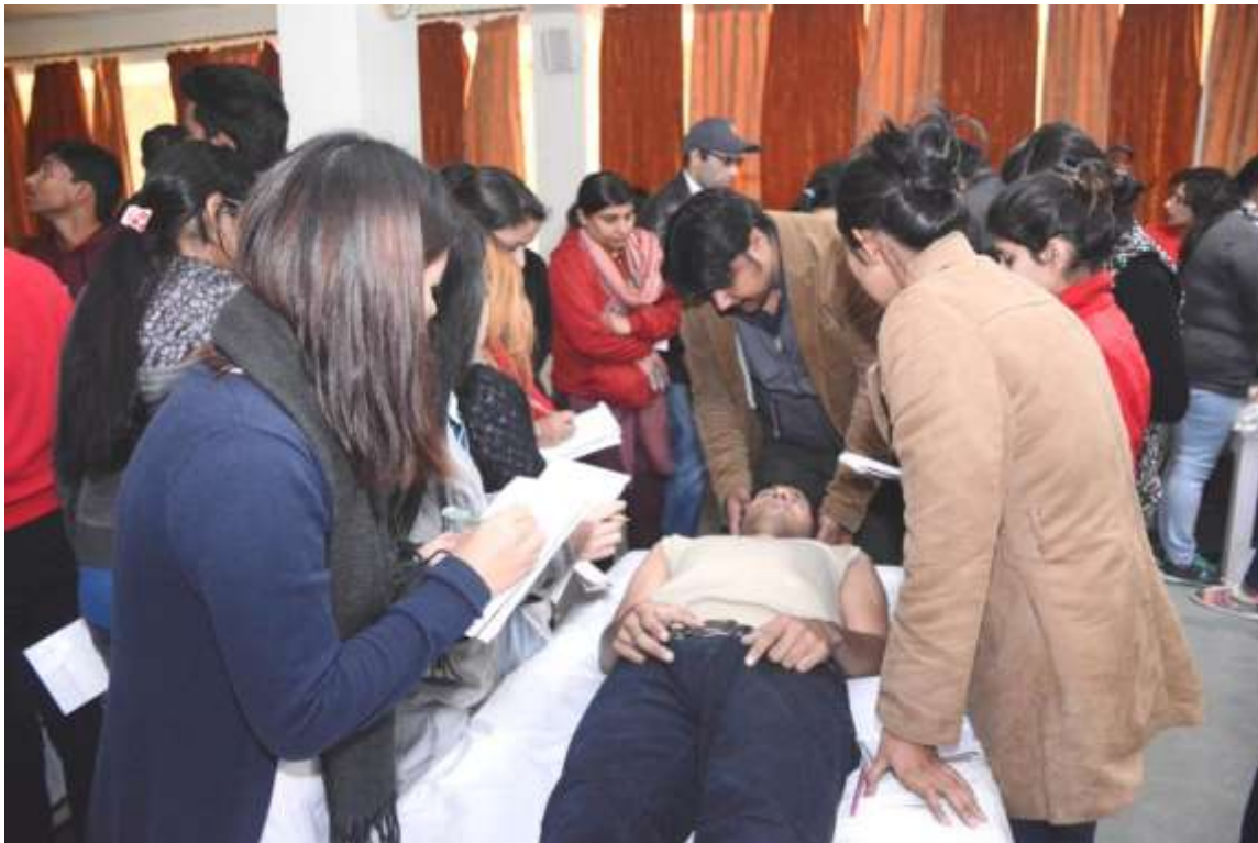
Workshop on 'Articular Dysfunction and management' .