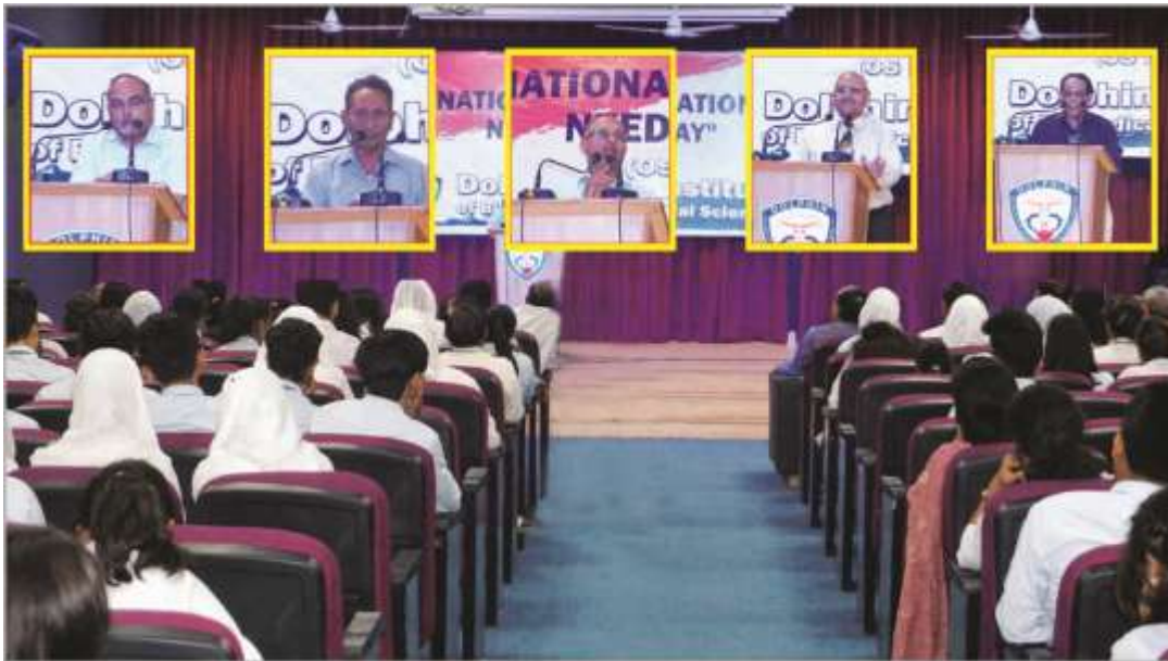
Seminar on 'Unity in Diversity' on 21 st August 2019.