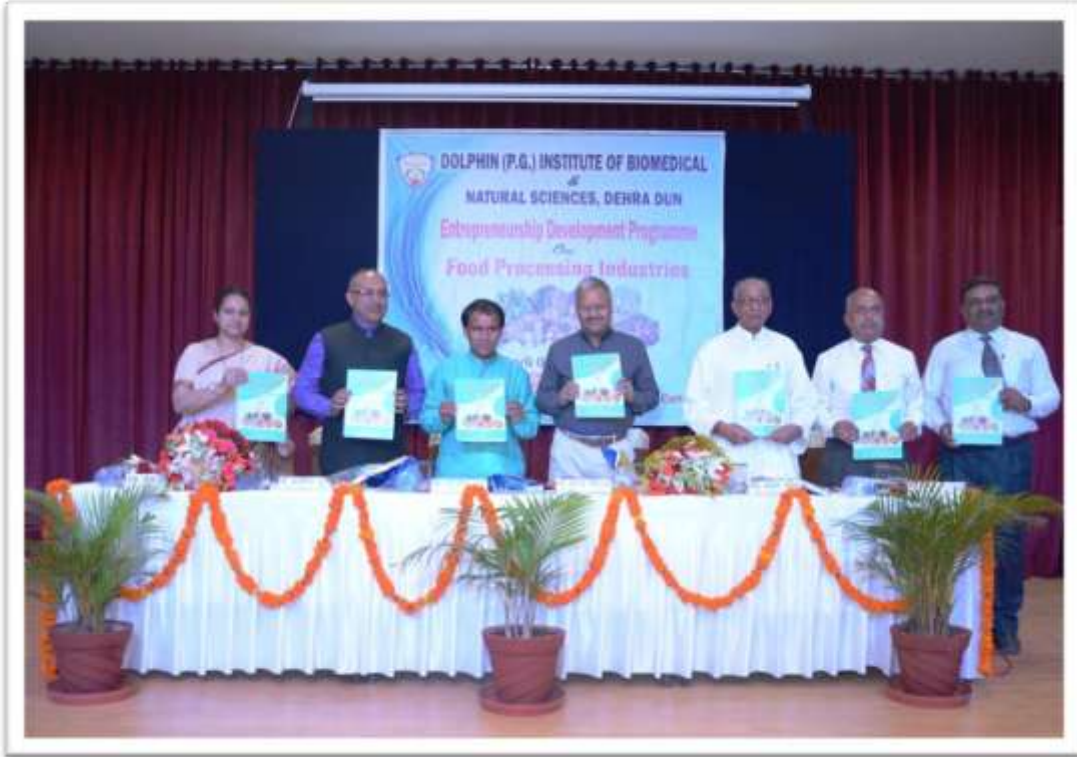
Release of training manual during the inaugural of EDP Workshop on Food Processing Industries on 2 nd April 2018.