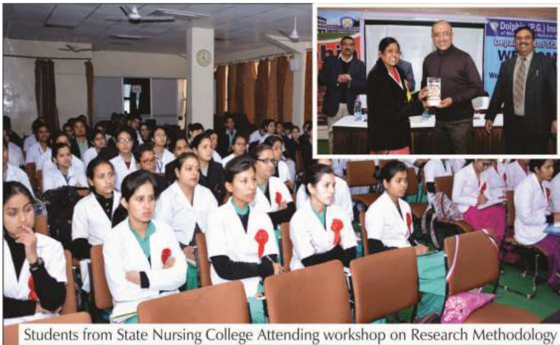
Students from State Nursing College Attending workshop on Research Methodology