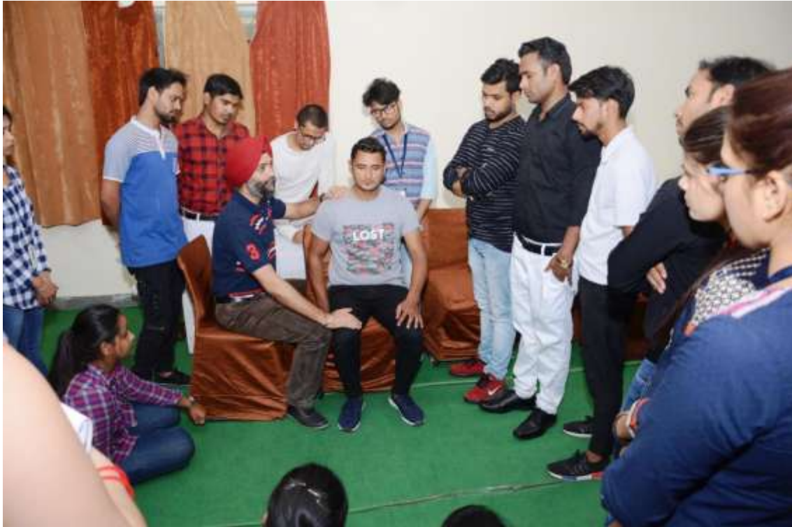
Hands-on-training on 'Neuro Developmental therapy' on 2-3 June 2018.