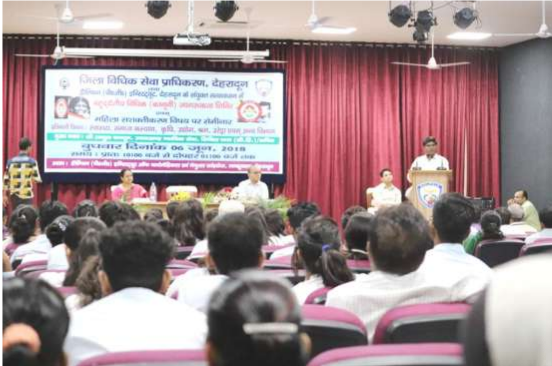
Inaugural of the Workshop on 'Women Empowerment with DLC on 6 th June 2018.