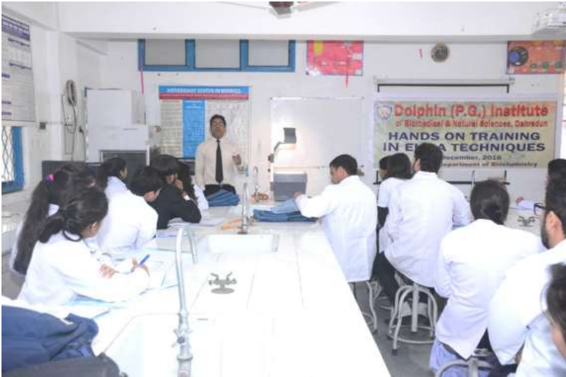
Hands-on-training on ELISA Techniques on 21 st December 2016