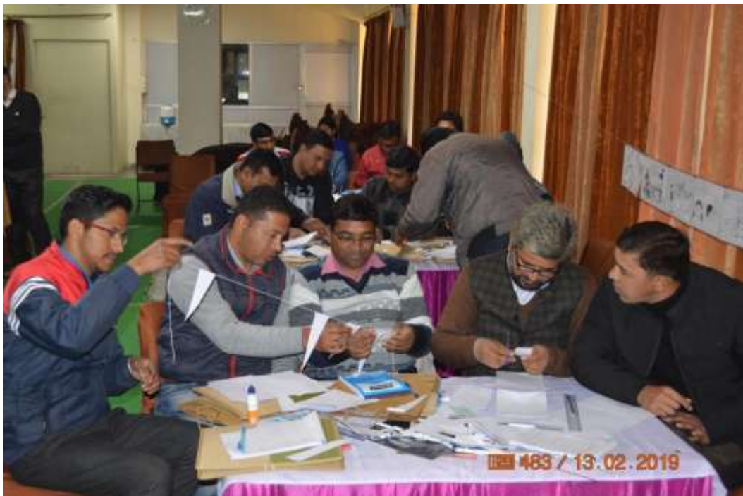
Participants engrossed in hands-on-training during the Workshop.