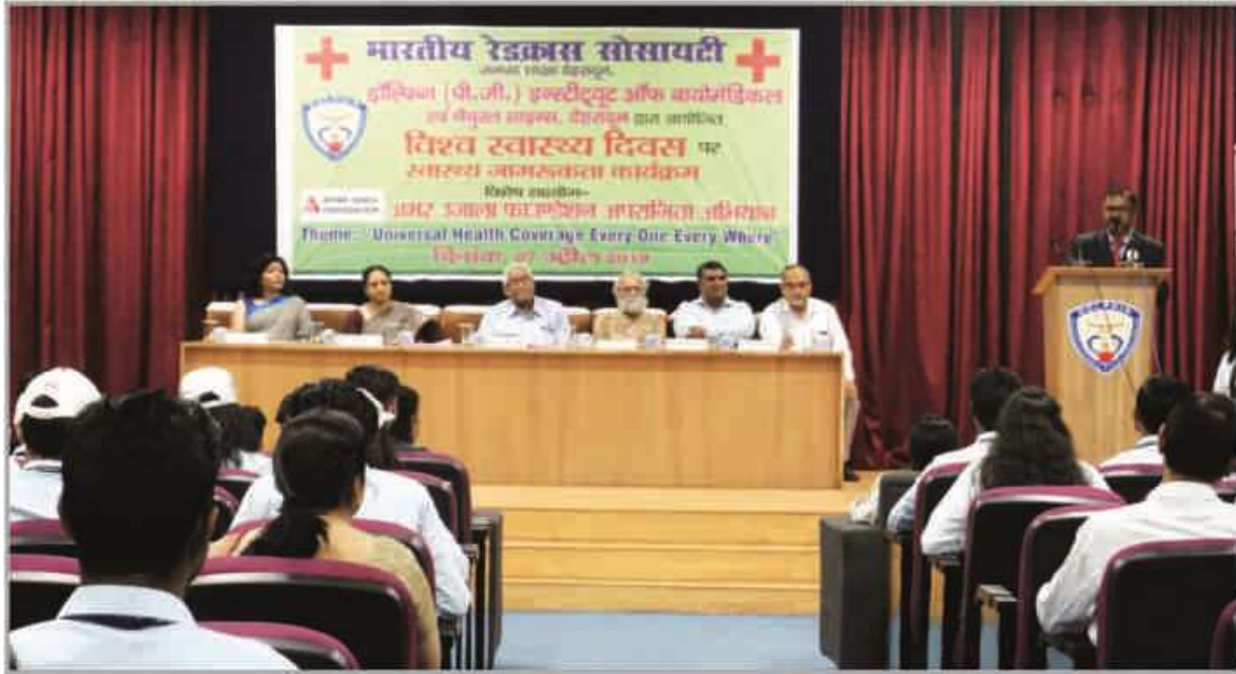
Seminar to commemorate 'World health Day' on 07 th April 2019.