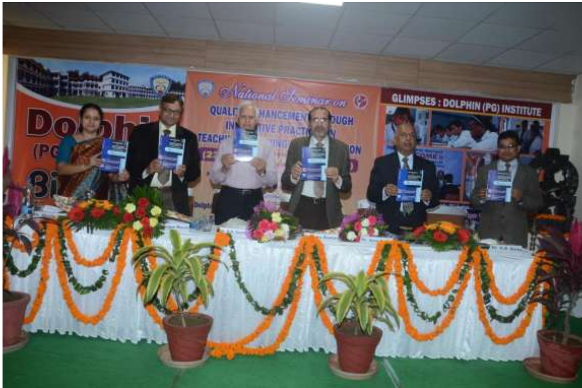
Releasing of Book of Abstracts in NAAC sponsored national Seminar on 'Quality enhancement Through innovative practices in November 2015.