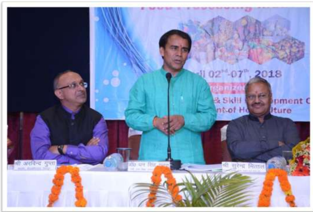
Honb'le Minister for Higher Education, Uttarakhand addressing the participants.