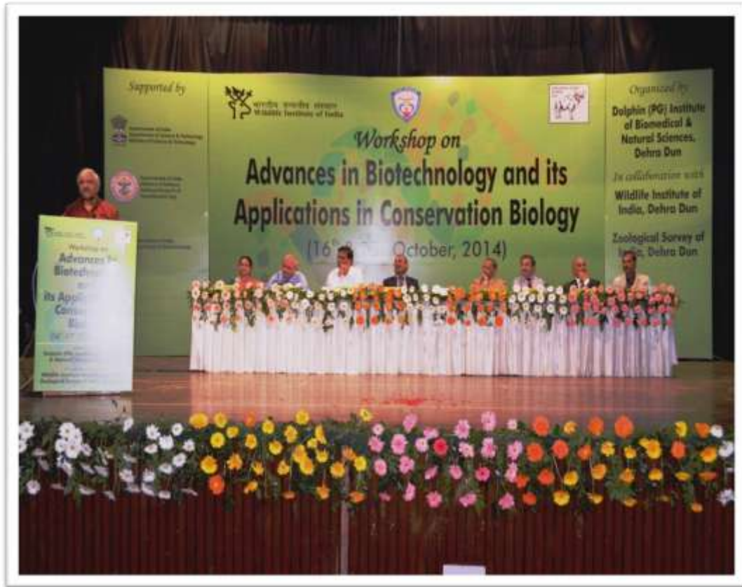
Hon'ble Minister for Env. & Forests, Uttarakhand addressing the participants of Workshop on 16 th October 2014.