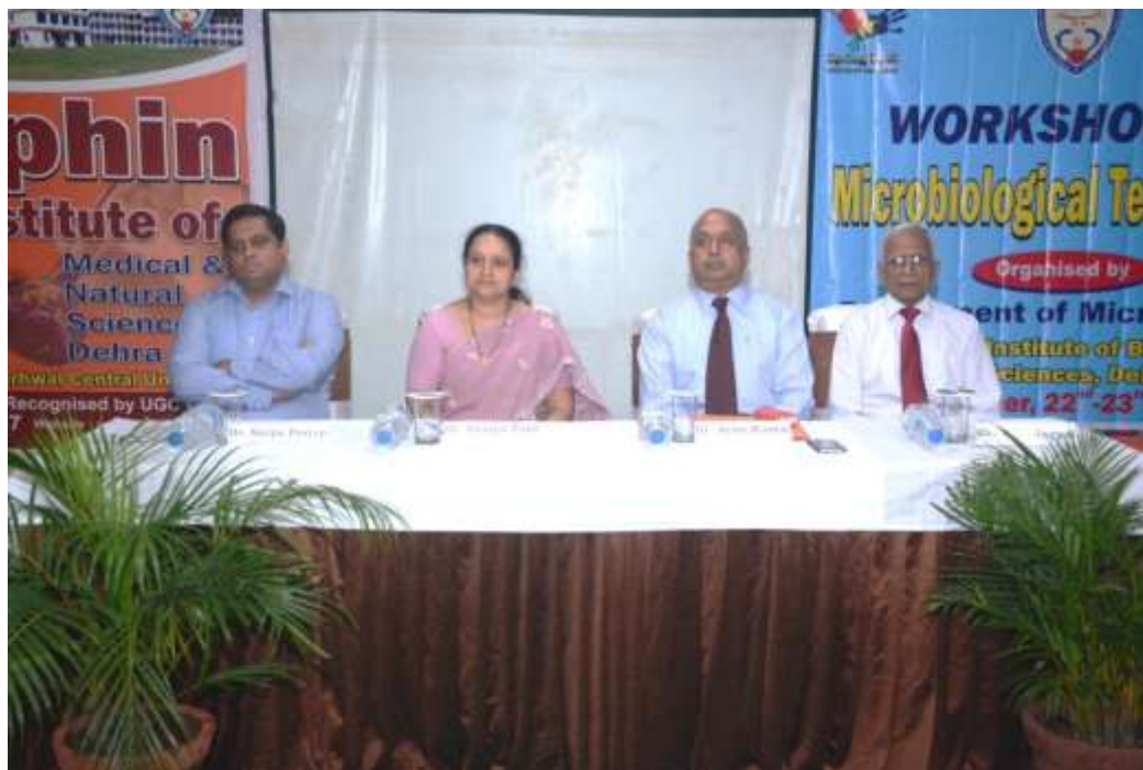
Inaugural of Workshop on 'Microbiological techniques' on 22 nd & 23 rd September 2017